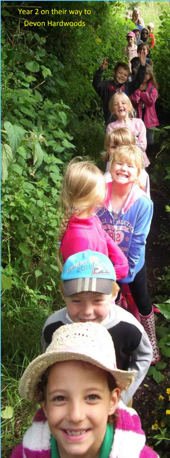
Year 2 on their way to Devon Hardwoods