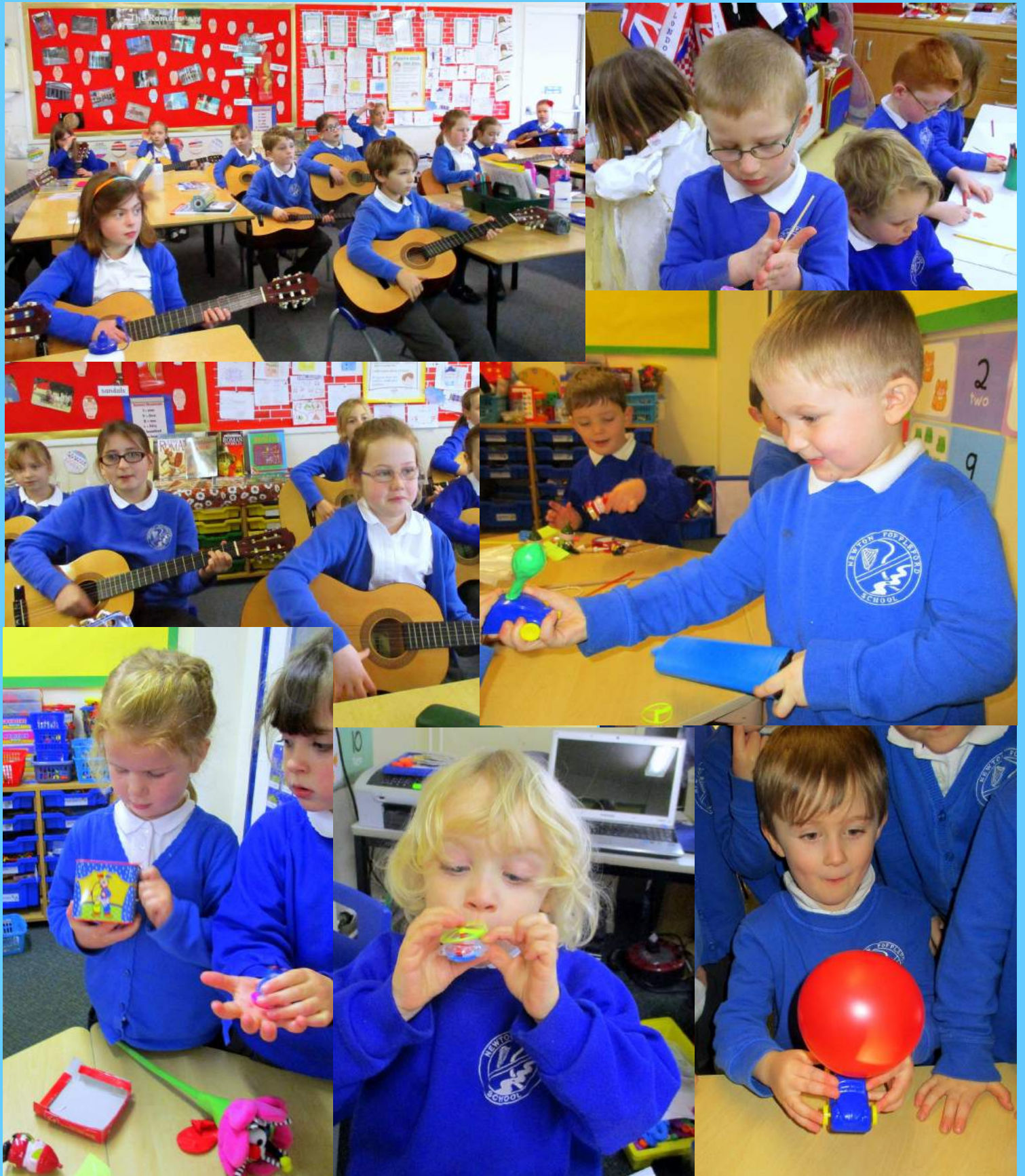
Year 4 are learning to play the guitar whilst Reception class enjoyed investigating toys!