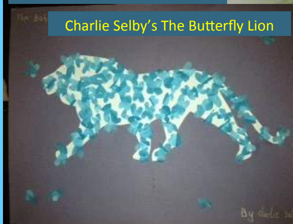
Charlie Selby's The Butterfly Lion