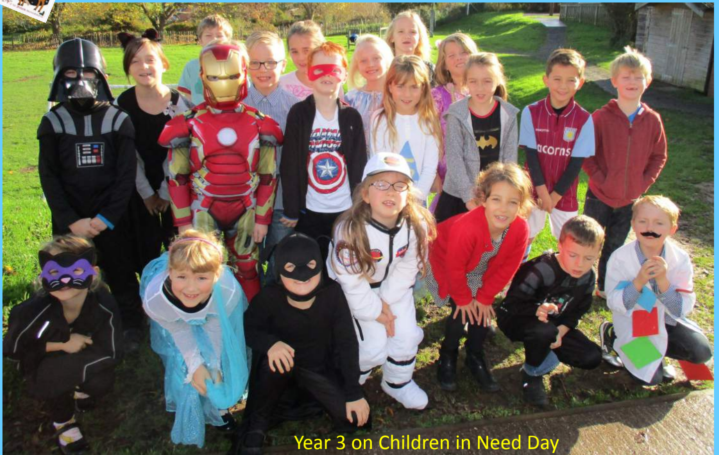
Year 3 on Children in Need Day