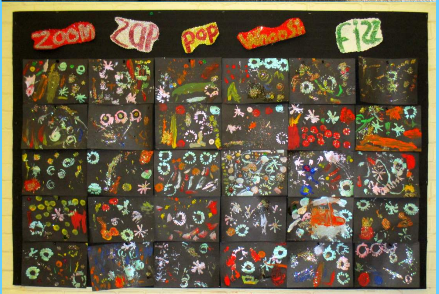
The Fireworks Display in Reception Class