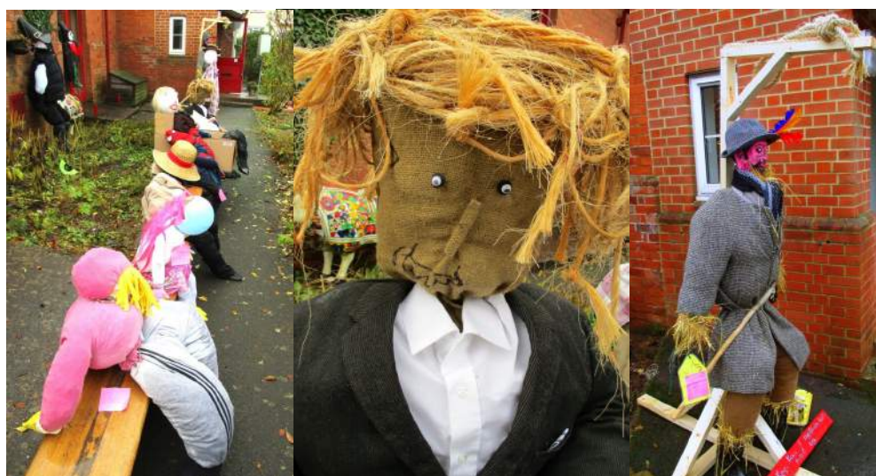
Some of the Guy Fawkes entries from last Friday. See the website for more photos.

I hope to see as many of you as possible next Tuesday.