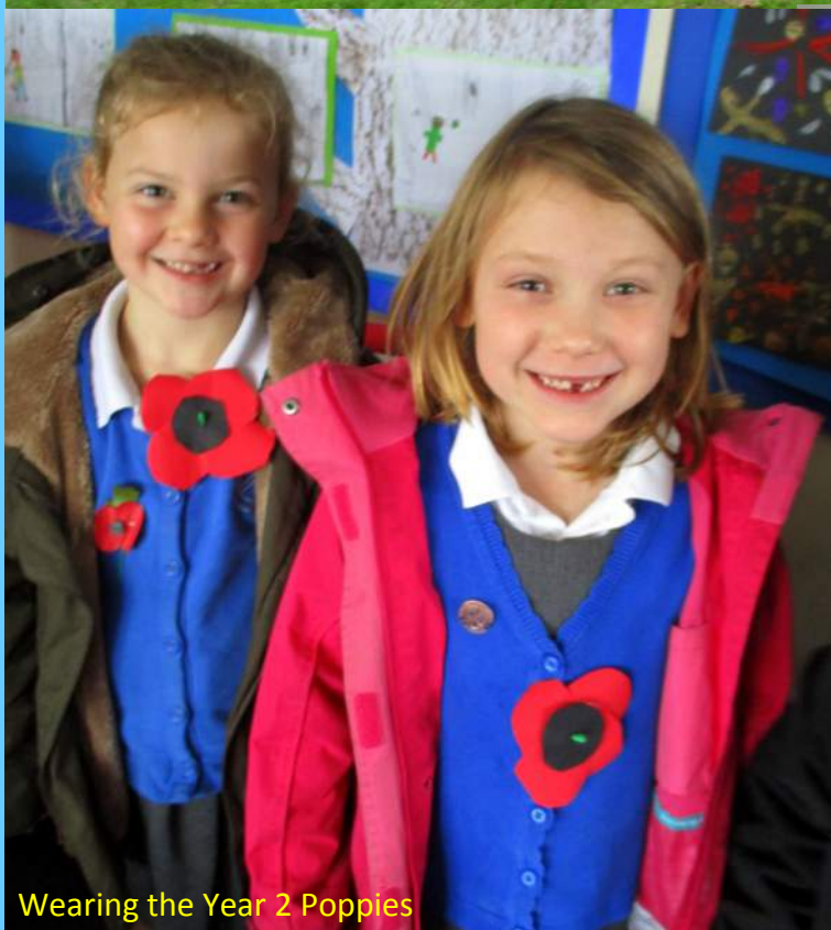
Wearing the Year 2 Poppies