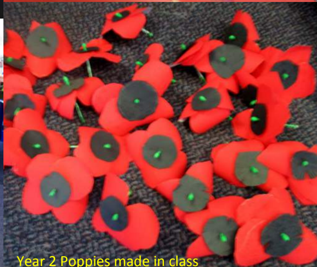
Year 2 Poppies made in class