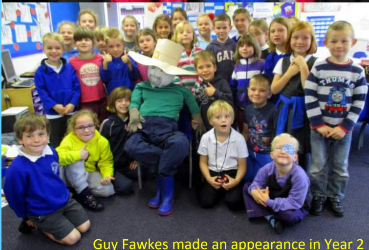
Guy Fawkes made an appearance in Year 2