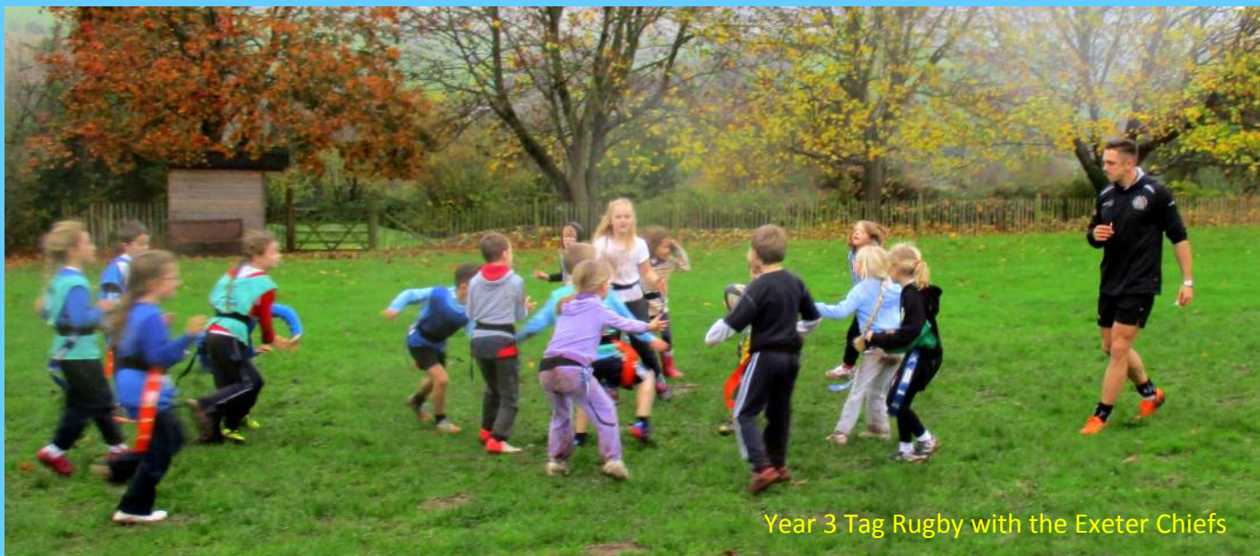
Year 3 Tag Rugby with the Exeter Chiefs