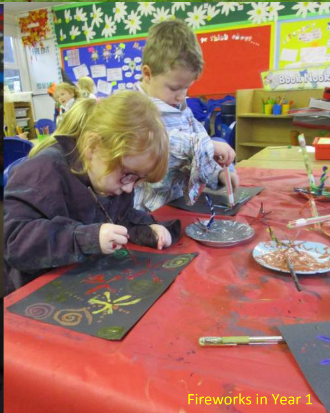
Fireworks in Year 1