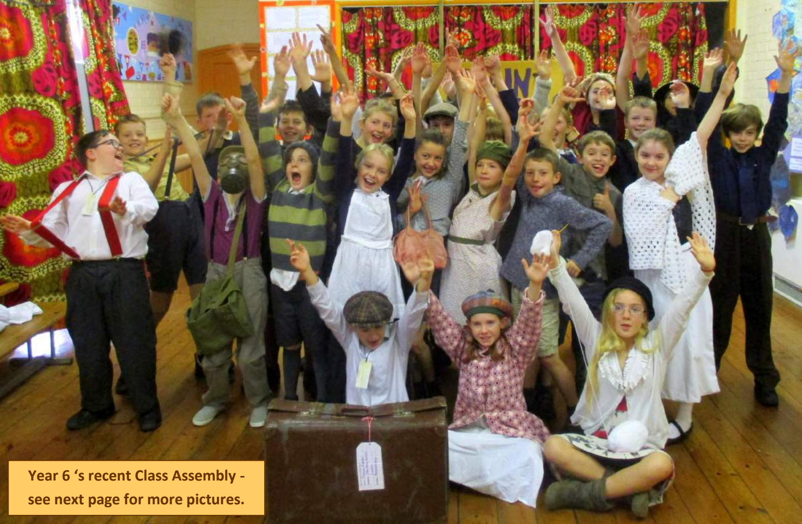
Year 6 's recent Class Assembly - see next page for more pictures.