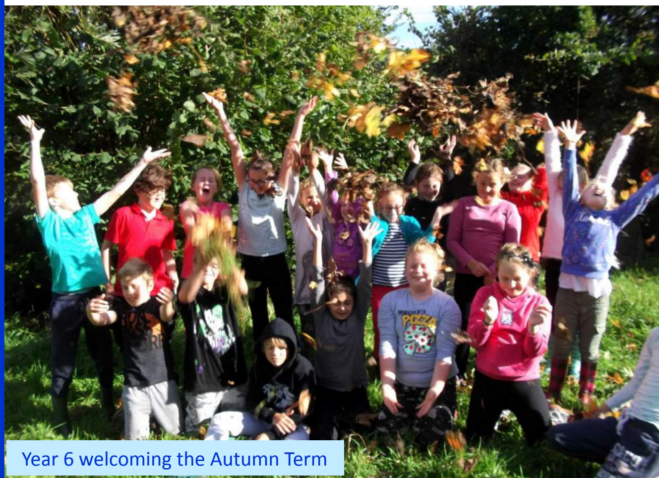
Year 6 welcoming the Autumn Term