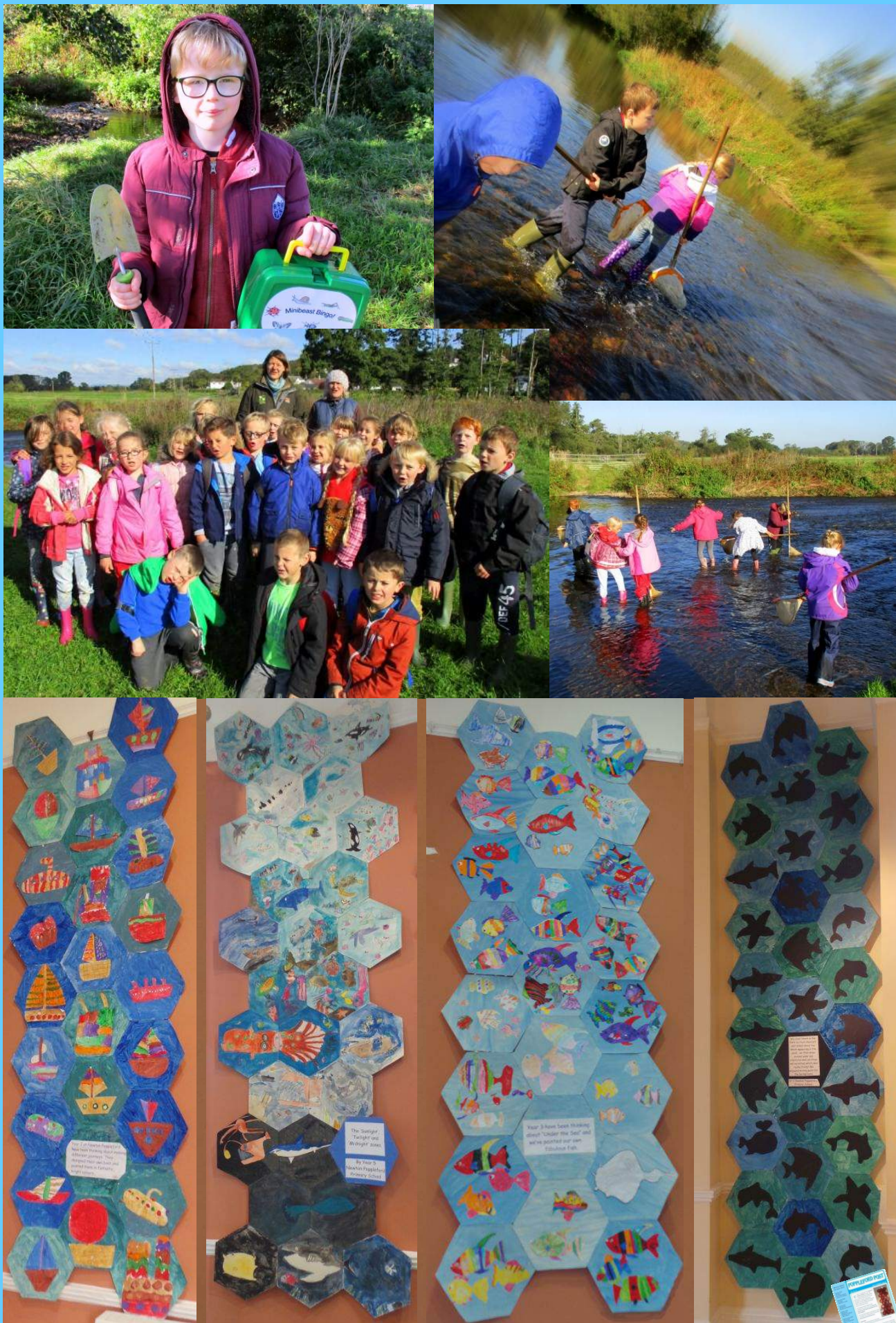
Some of our Hexagon entries in the Sidmouth Science Festival

Year 3 spent the morning in the River Otter with the East Devon River Ranger*