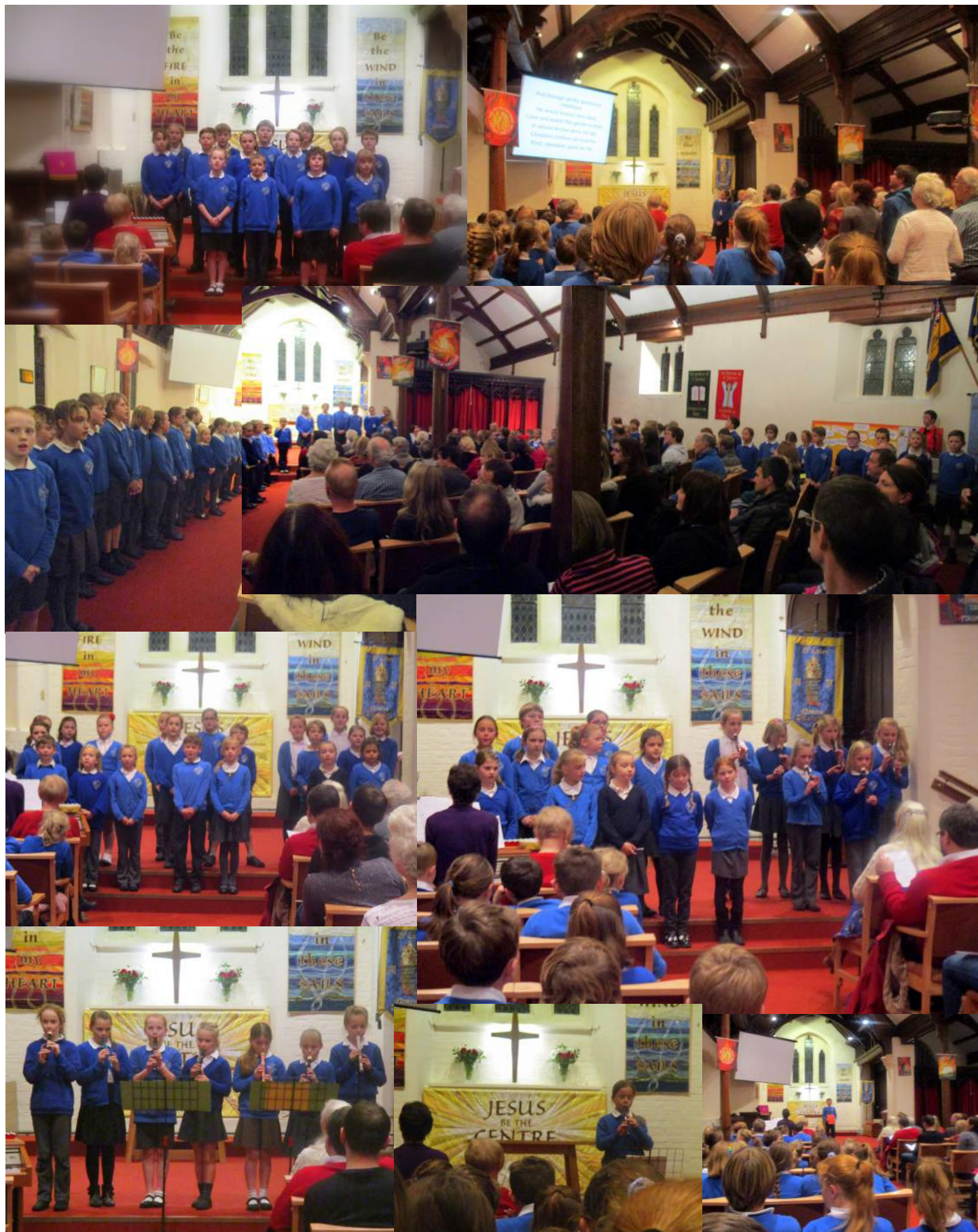
Recorder players, readers, carol singers and congregation from the KS2 Carol Concert in St Luke's Church.