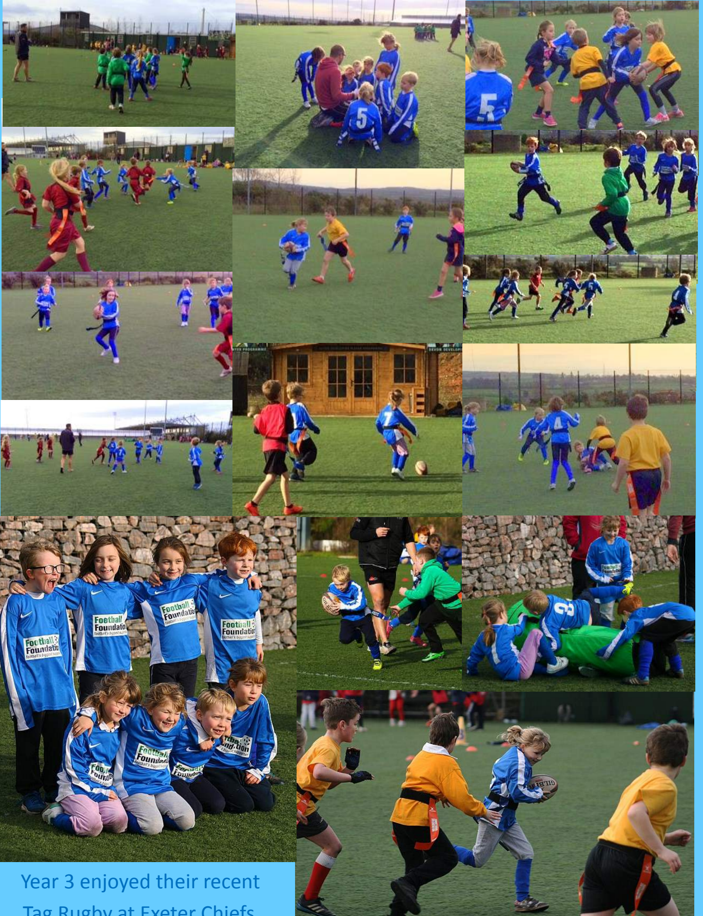
Year 3 enjoyed their recent Tag Rugby at Exeter Chiefs.