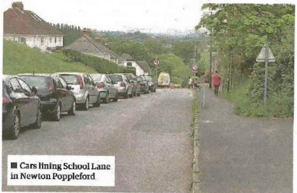
■ Cars lining School Lane in Newton Poppleford

"Children cannot see over the parked cars and drivers cannot see the children on the path.