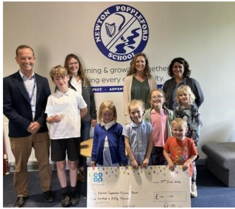
A big thankyou to the Co-op and the PTFA for the generous donation to the school .